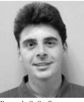
Fernando C. Graff Southern & Dobson campus