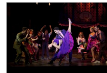
2011-12 local arts preview