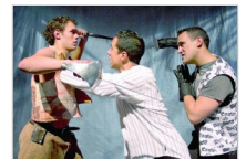
Theater Works tackles Shakespeare's 'Romeo