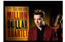
Video: ASU Gammage season