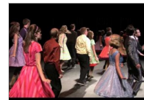
Video: Get Out Performing Arts Expo