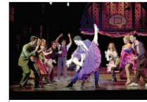
See a different view of 'West Side Story'