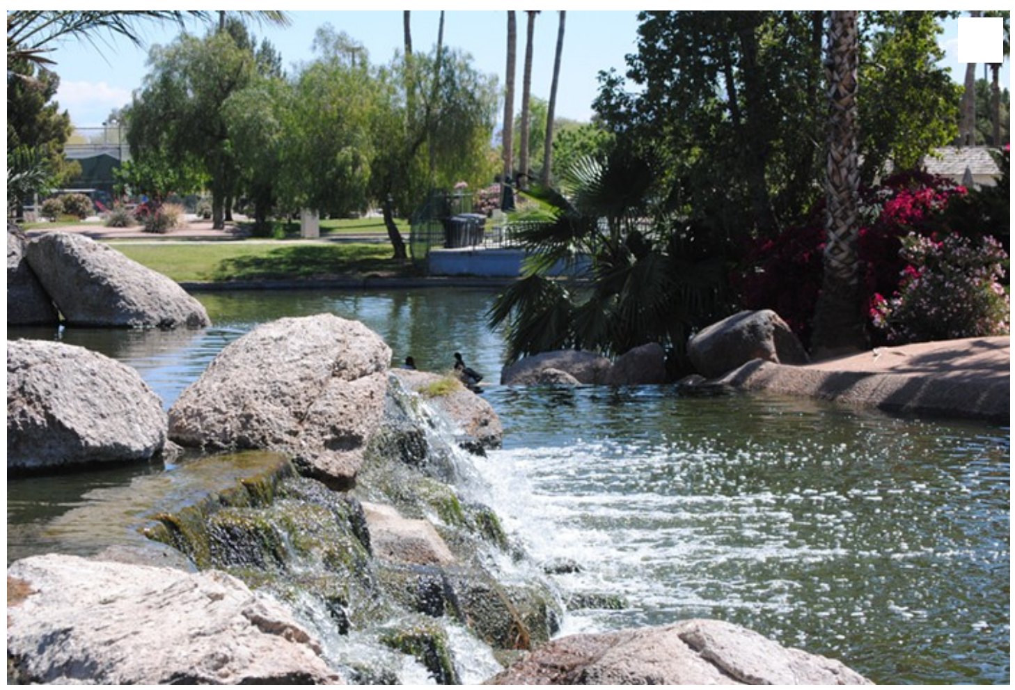
Freestone Park in Gilbert.