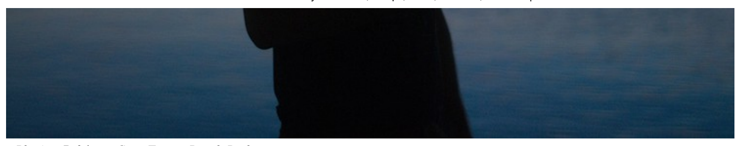
Playing Pokémon Go at Tempe Beach Park.