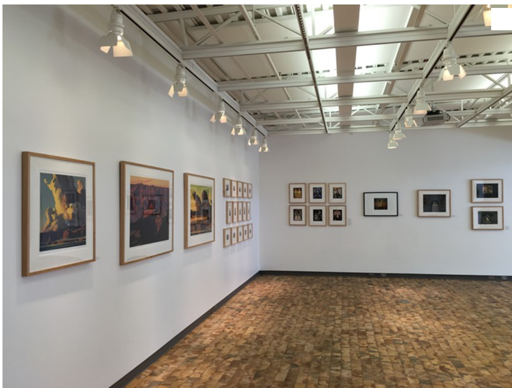
Newly-opened Mesa Community College Art Gallery.

permanent installations for Valley Metro. Her The Memory of a Tree is Strong , comprising deep red water-cut steel art panels inspired by childhood memories of Mesa pecan groves, is part of a new pop-up park located along the Central Mesa light rail line.