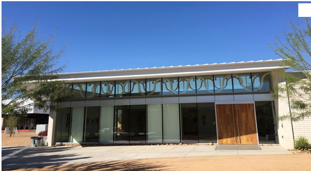
Entrance to the new Mesa Community College Art Gallery.