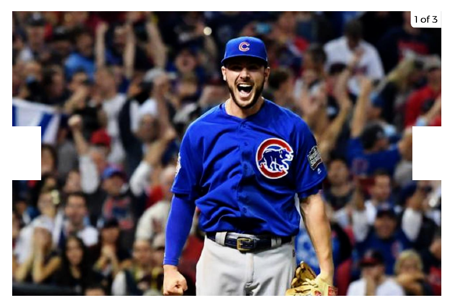
Chicago Cubs third baseman Kris Bryant makes the final out over the Cleveland Indians during the tenth inning of World Series game 7 at Progressive Field in Cleveland, Ohio, on November 2, 2016. Chicago won 8-7 to celebrate a World Series win for the first time in 108 years.

Feb. 16 (UPI) -- Joe Maddon's Chicago Cubs clubhouse promotes perennial pranking.