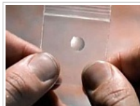
"Limitless Pill" BANNED in 49 States Except Arizona