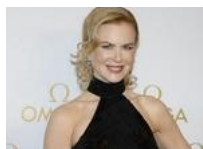
Empire Creator Lee Daniels Teases a Nicole Kidman Cameo