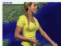
You Have To See These Hilarious Viral Pictures