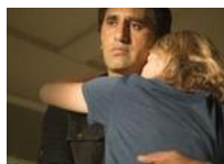
Fear the Walking Dead: What We're Hoping For in Season 2