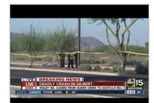
Police investigating deadly hit-and-run in