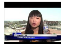
Despite excessive heat, some residents