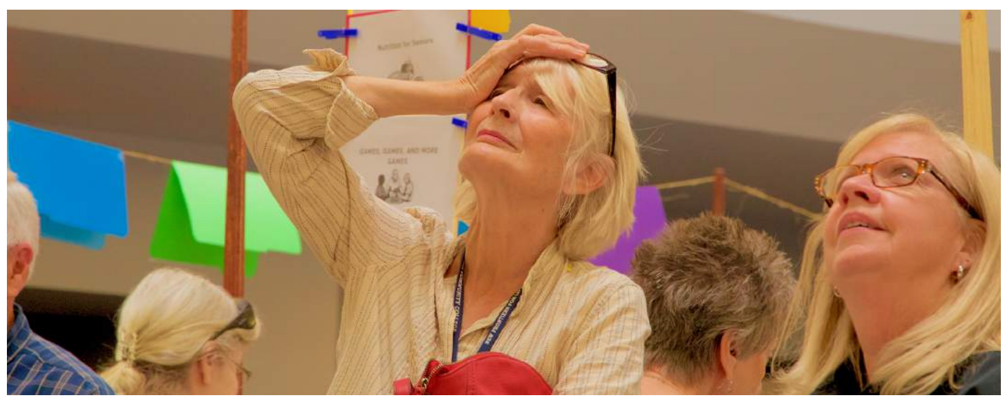
SO MANY CLASSES!