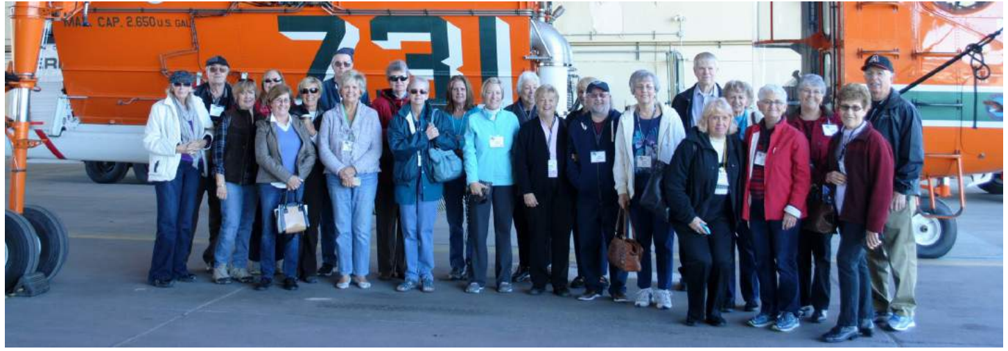
GATEWAY TOUR – JANUARY 12