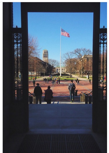
2015 PHOTO CONTEST