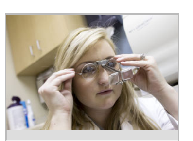
Medicine runs strong in Valley family