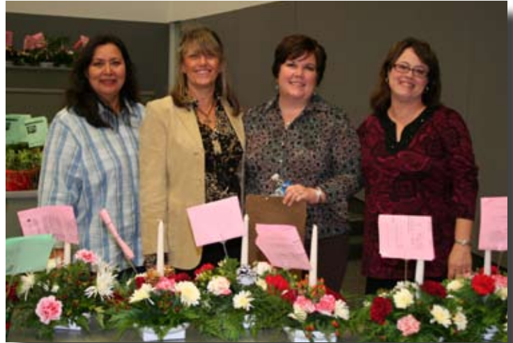
MCC alumni and instructor helped judge high school students' work at the floriculture competition.