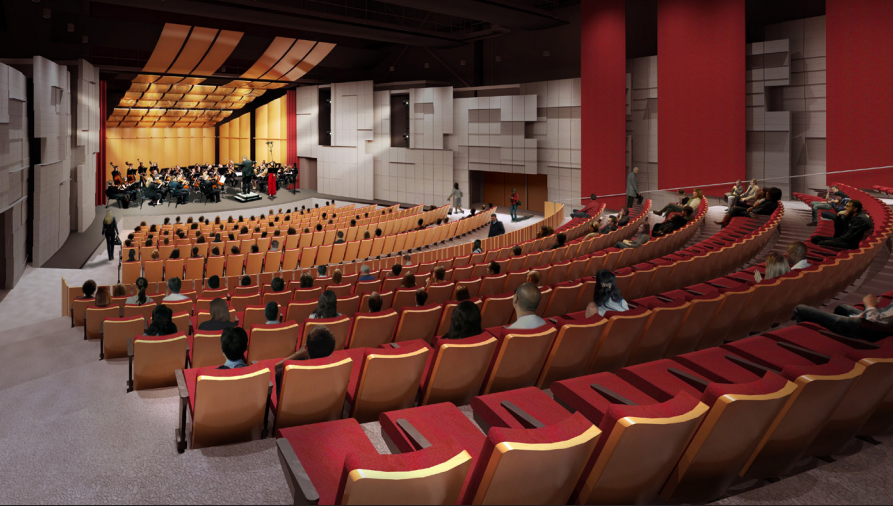
The Performing Arts Center (PAC) is a 462-seat theater and state-of-the-art educational and entertainment venue.

The new PAC will showcase a variety of musical theatre, dance, band, orchestra, choir, and performing ensembles within a vibrant venue of lights and technological magic.