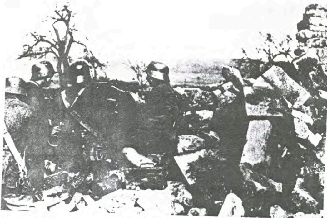
German machinegun being fired at the 28th Division in Fismettes, second battle of the Marne.