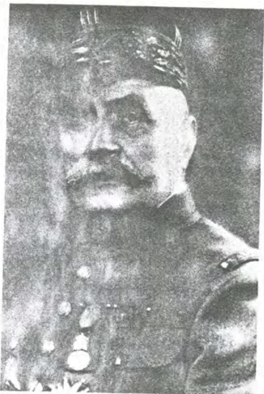
Marshal Ferdinand Foch, who was instrumental in stopping the enemy advance at the first battle of the Marne, later assumed unified command of the British, French, and American armies.

Thanks to careless German security and talkative prisoners, the French high command gleaned detailed information about an assault, code-named Friedenssturm , or peace offensive, that the Germans intended to launch in mid-July in the Chateau-Thierry and Rheims sectors with the intent of enlarging the Marne salient. Armed with this information, Gen. Philippe Pétain, commander-in-chief of the French army, instructed his army commanders in the threatened areas to strengthen their front line positions to keep the Germans from breaking through to the second defensive position. 6 The