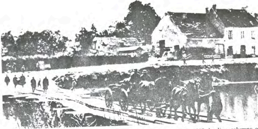
Pontoon bridge in use at Chateau-Thierry.

started a fighting retreat. 29 Altogether, eighty-three of the 239 men on duty with the company reached safety.