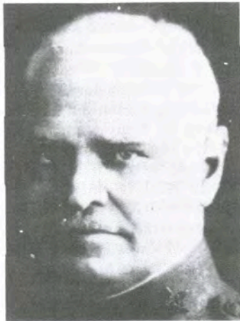
▲ Major General George W. Goethals, longtime friend of General Johnson, was placed in charge of supply matters for the Army