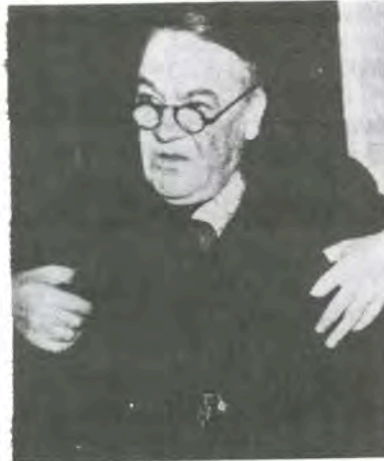
Brigadier General Hugh S. Johnson

The Army refused to accept the premise that industrial mobilization was a business proposition and should be managed by businessmen. It was dominated by "old-school" officers out of the 19th Century, officers who had yet to realize "that it was no longer possible to compartmentalize civilian and military functions" as had been the case before 1917. 8 Inherently sus-