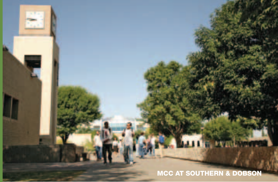
MCC AT SOUTHERN & DOBSON