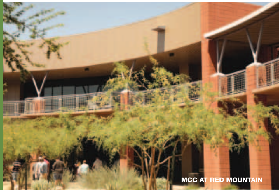
MCC AT RED MOUNTAIN