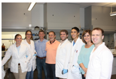
Science Research Team at Mesa Community College

Mesa Community College provides outstanding transfer and career and technical programs, workforce development, and life-long learning opportunities to residents of the East Valley area of Phoenix, Arizona. MCC excels in teaching, learning and empowering its more than 40,000 students who attend annually to succeed in a local and global community. Mesa Community College is one of ten colleges that comprise the Maricopa County Community College District.